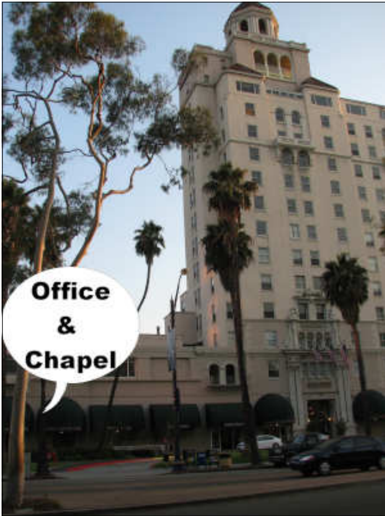
Breakers Building 210 E. Ocean Blvd Long Beach 90802